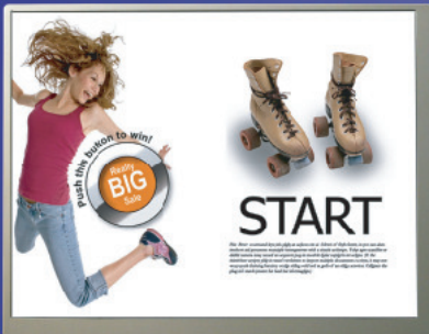
5.7" TFT LCD